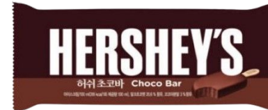
Hershey's brand ice pop