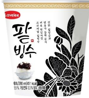
red bean shaved ice dessert