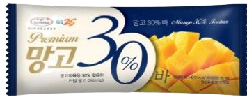
mango ice pop