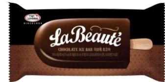
choco ice pop