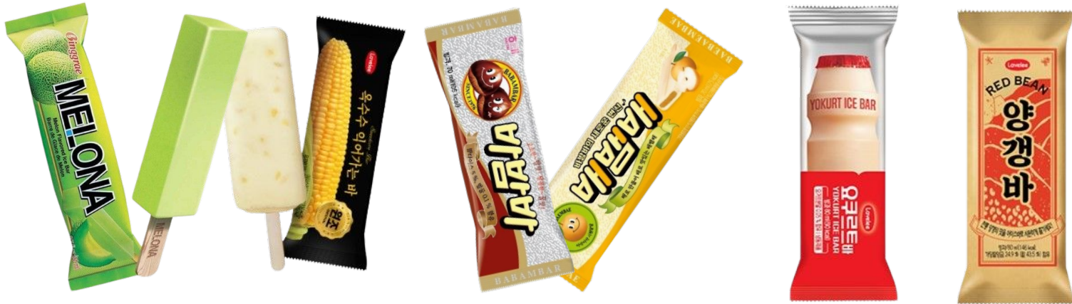
melon ice bar