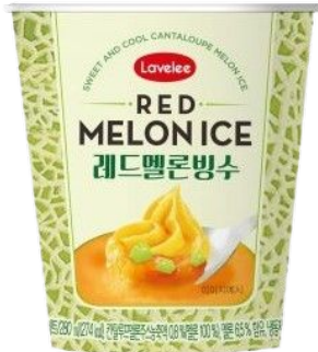
melon shaved ice dessert