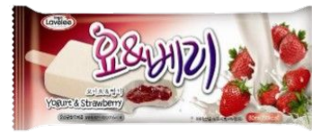
yogurt+berry ice pop