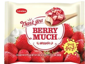
strawberry ice cake