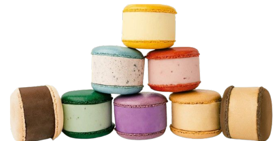
macaron ice cream sandwiches

Product will be vary according to the location