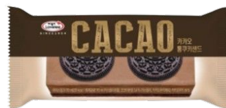
cacao ice pop