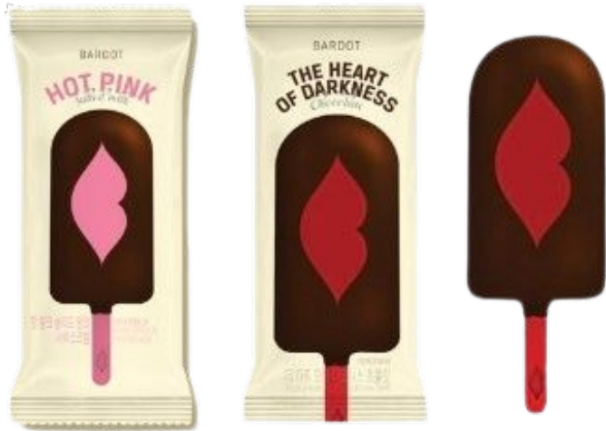
Bardot chocolate pops