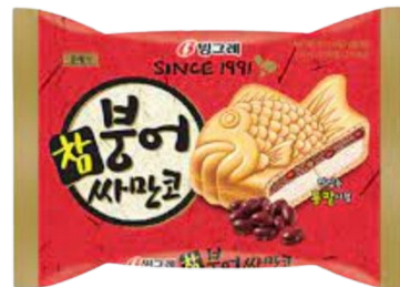
bean paste ice cake