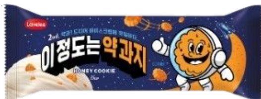
yakgwa ice pop