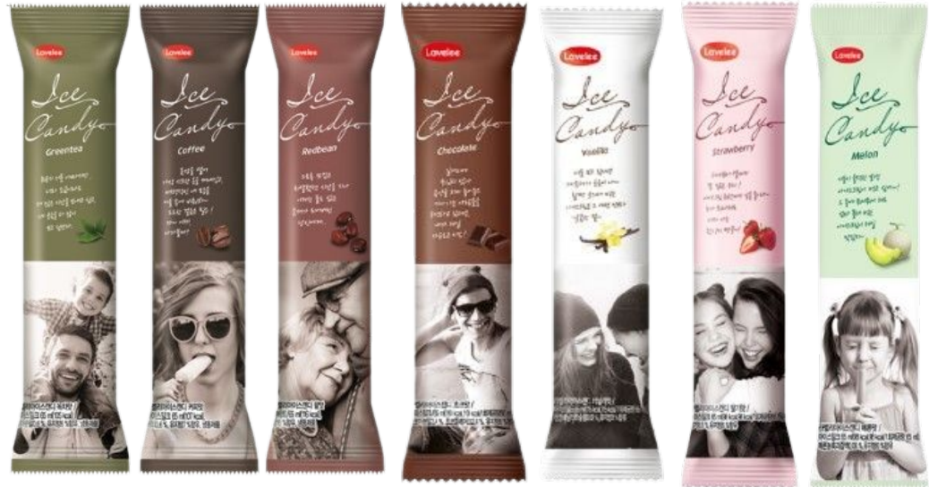
various flavored Ice bars