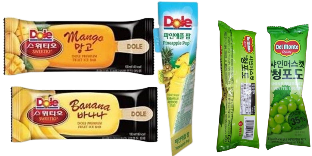
“Dole” brand ice pops