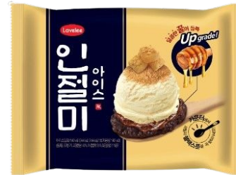
iced rice cake