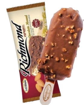
armond+choco ice pop