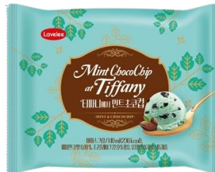
mint chocolate ice cake