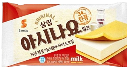
cookie ice cake