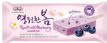
blueberry ice pop