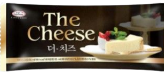
cheese ice pop